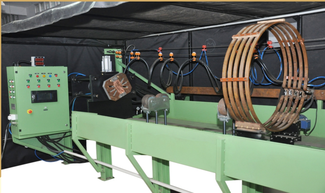
MPI Machine For 6m Long Crankshaft weighing 2 Tons.